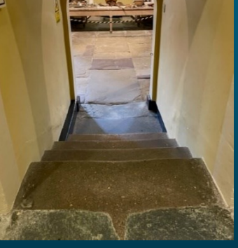
Old Kitchen Staircase